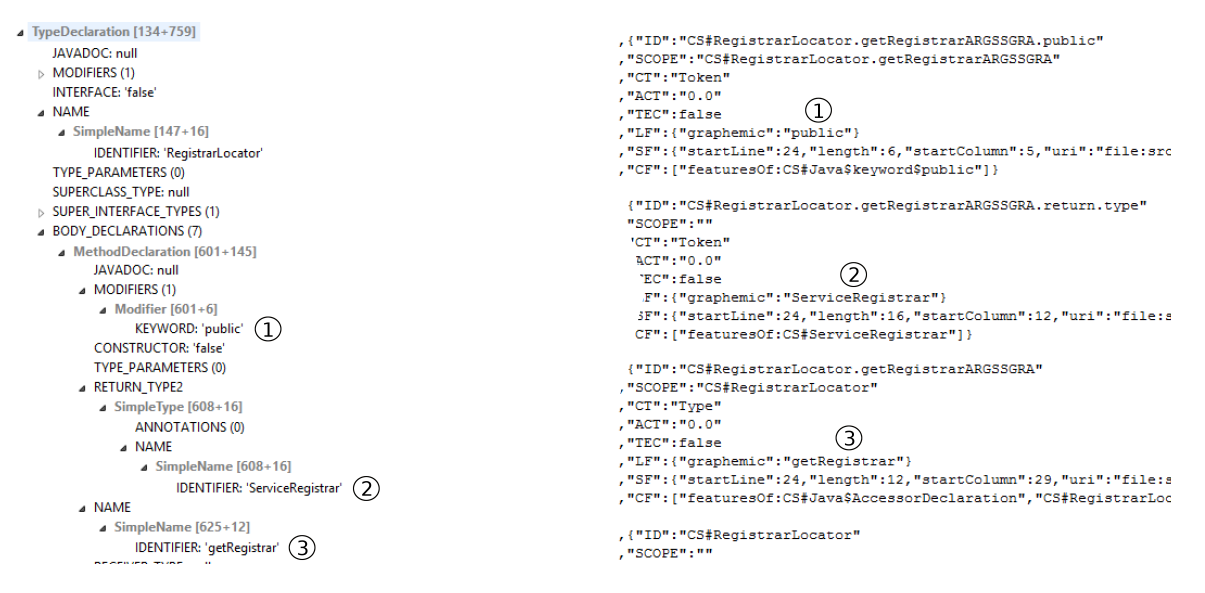
Figure 3 – Abstract syntax tree (left) and intermediate knowledge representation (right) for the code shown in Figure 2. The knowledge representation is input into a jACT-R model that creates chunks in declarative memory from the intermediate representation.

of the chunk at the time of the retrieval, because retrieval is faster for higher activation. The jACT-R model is assumed to model the comprehension of anaphors in source code, if it re-generates the fixation durations input to it. This is not the case so far, the model currently over-estimates fixation durations (Lohmeier & Russwinkel, 2015). If the generated fixation durations are reasonably close to the durations of experimentally-obtained fixations input into the model, the model may be assumed to match cognitive processing in humans reading anaphors in source code in situations resembling the experimental setup. At that point, the activation values of a chunk computed by the model might be used to forecast whether it will be easy or hard to understand an indirect anaphor whose comprehension requires the chunk to be retrieved from memory.