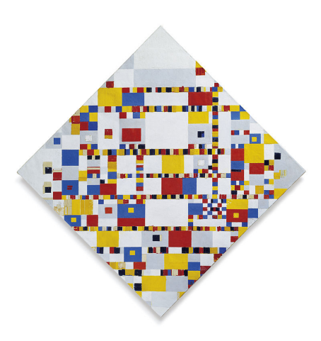
Figure 2 – Victory Boogie Woogie - Piet Mondriaan

Some participants however did use the idea of the art style as an inspiration, for example, one group that received rococo made the observation that rococo is the opposite of efficient, it uses a lot of fluff to deliver a message. They therefore created a sorting algorithm as inefficient as possible.